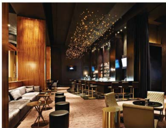
TRANSCONTINENTAL CHIC From left: Baccarat Hotel and Residences in New York; Deerfield Beach's Royal Blues Hotel; and the trendy Delano Las Vegas all have a polished aesthetic that's taking over America's newest hotels.