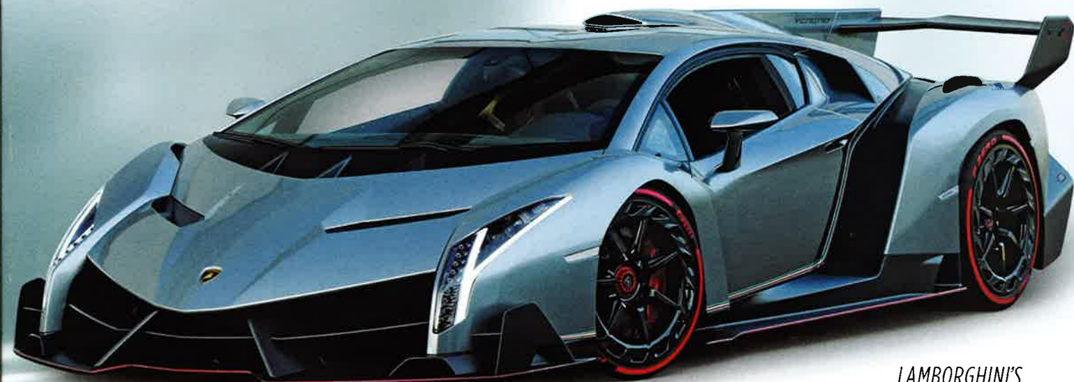
LAMBORGHINI'S $4 MILLION VENENO

LAMBORGHINI | ULYSSE NARDIN | CARTIER | DOM PÉRIGNON | AMAN RESORTS | NOBU | LOUIS VUITTON AUDEMARS PIGUET | PORSCHE | HERMÈS | WALLY YACHTS | ERMENEGILDO ZEGNA | HERITAGE AUCTIONS SINGITA | PHILIPPE STARCK | FOUR SEASONS HOTELS AND RESORTS | DUCATI | WILLIAM GRANT & SONS EMBRAER | CHANEL | GAGOSIAN GALLERY | REESE YACHTS | DAVIDOFF | STEINWAY LYNGDORF | BMW