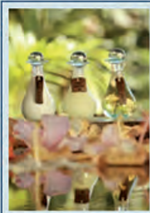
hand-made bodycare products

As for her personal and greatest challenge of running paradise on earth, the answer is simple: staying self-disciplined!