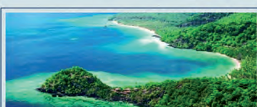
Laucala paradise hideaway

Serene sun-kissed white beaches, sparkling turquoise waters, small romantic coves, emerald green lush tropical vegetation and spectacular ocean views wherever you are - Laucala Island, Fiji is nothing short of paradise.